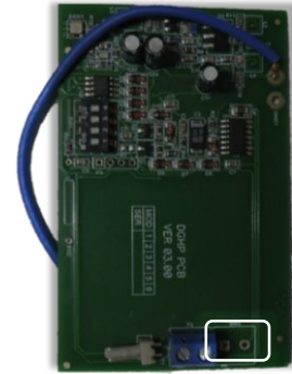
Normally Closed Connectors