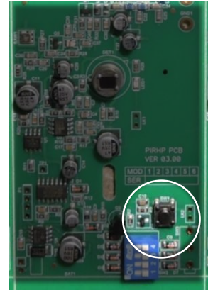
Transmit Button on Passive