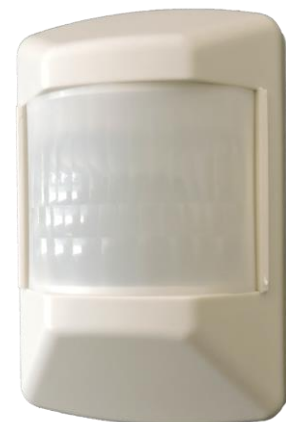
Venus Wireless Passive